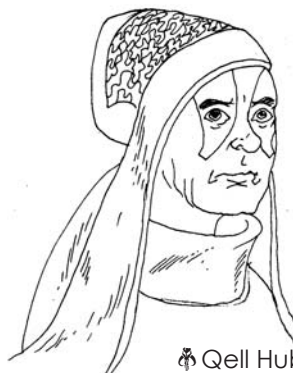
♣ Qell Huba-Phuut

Feats: Alertness, Great Fortitude, Infamy, Starship Operation (space transports), Weapon Group Proficiency (blaster pistols), Weapon Group Proficiency (simple weapons), Weapon Group Proficiency (vibro weapons).