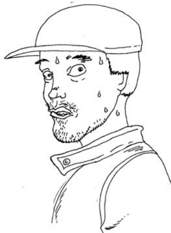
♣ Sandblasto McXu

Weapons: BlasTech DL-18 blaster pistol (4D damage), 2 surgical blades (Skill: melee weapons; STR+1 regular damage; upon successful moderate Medicine roll STR+2D doctor's damage; obviously this only works on organics and not droids)