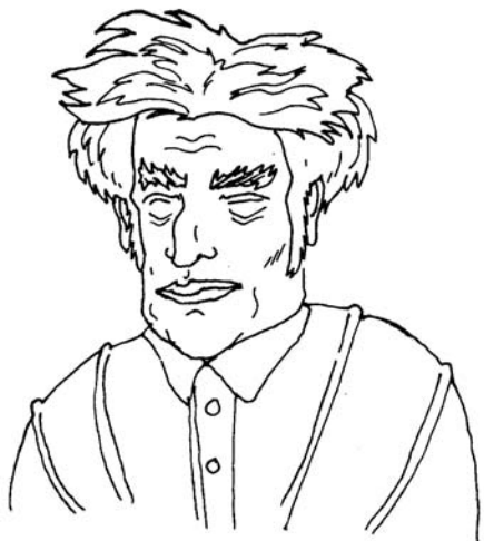
♣ Skvam Skrakatoom

Feats: Endurance, Martial Artist, Skill Emphasis (Treat Injury), Skill Emphasis (knowledge: medicine), Weapon Group Proficiency (blaster pistols), Weapon Group Proficiency (simple weapons).