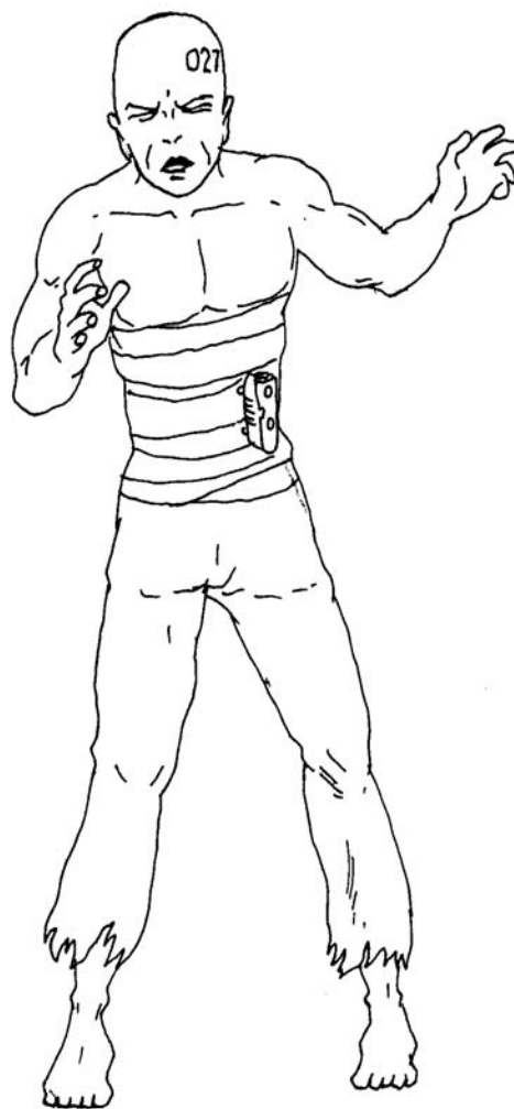
☞ Spleen Zombie-clone

What can be a problem are the cheaper cloned spleens that are marketed by low-end medical institutions, like Prof. Chaba-Joo's Discount Medical Emporium on Nar Shaddaa. Although the procedure for the patient is virtually identical as the expensive one, there might be two differences. The treatment is cheaper, between 2,000 and 10,000 credits; and the spleen is grown in a fully cloned human after which the spleen is harvested and the clone body, bereft of flash learning and sentience, is destroyed. Once in a while, the clone gains sentience and escape after having his spleen harvested. When that happens the clone either dies quickly because of a malfunctioning blood and immune system, or if it gets a new spleen, it comes after the person transplanted with its spleen.